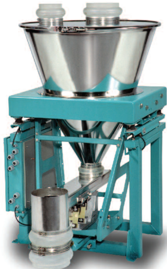
Vibratory feeder with discharge tube