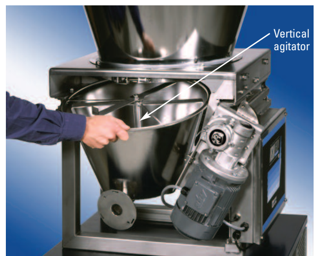
Internally agitated screw feeder